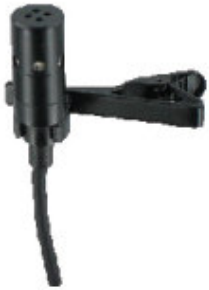
IVA 346L Lavalier Microphone

IVA lavalier microphone series are designed to maximize mobility and minimize microphones visibility . Action and movement is needed to express yourself during live performance or speech to attract audience attention. IVA lavalier microphone series allow greater freedom and flexibility in your movements with minimal microphone visibility . The small and lightweight design does not compromise its quality and performance. High SPL handling make it